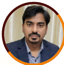
Dr. Rajendra Prasad